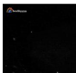
Without white light